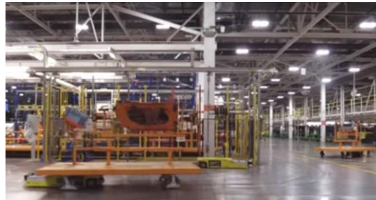
Door panel transported on AGC

Watching them marry the chassis to the body was especially interesting. In the past, the body was lowered onto the chassis, but with the C8, the chassis is brought under the body on an AGC and then raised to meet the body that is on an aerial track. The wheels of the car never touch the ground until the very end of the line. At the end of the tour, we watched the finished cars coming off the line, and going over the “bump test” where the driver guns the car and runs it over a speed bump! Next, they go to the “water test” where they are sprayed with 8000 gallons of pressurized water in about two minutes to test for leaks.