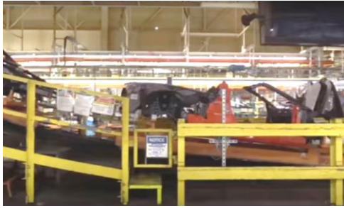
Start of Trim

various assembly stations and they move between blue lines on the floor. One of the important safety rules is to stay in the walkways and not step out into the paths of the vehicles.