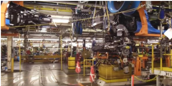
Marriage of body and chassis

The new paint facility is an engineering marvel as well. It is about 700,000 square feet and completely automated. They no longer paint just one color at a time. The robotic paint arm has a multi-nozzle feature that rotates to the specific ordered color of the body parts as they go through the paint line. One set of panels might be black, the next orange, the next any other color. In the basement of this three-story facility is an environmentally friendly dry scrubber system that captures the excess paint, mixes it with liquid limestone so they adhere to each other, then dries it so it can be used in concrete.